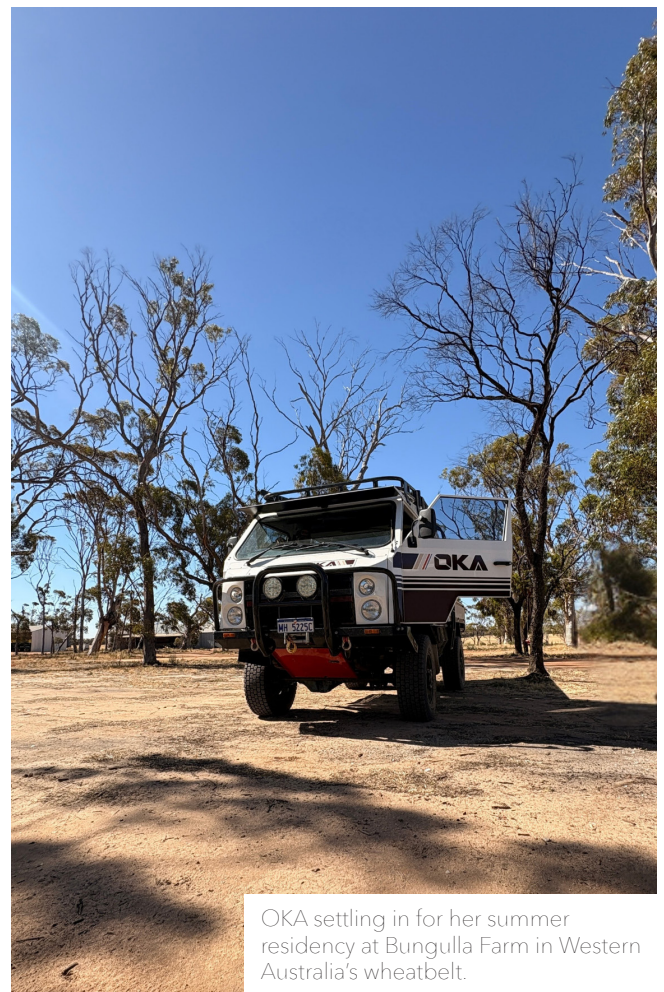
OKA settling in for her summer residency at Bungulla Farm in Western Australia's wheatbelt.

This is where OKA's engineering architecture and multi-use capability become critical.