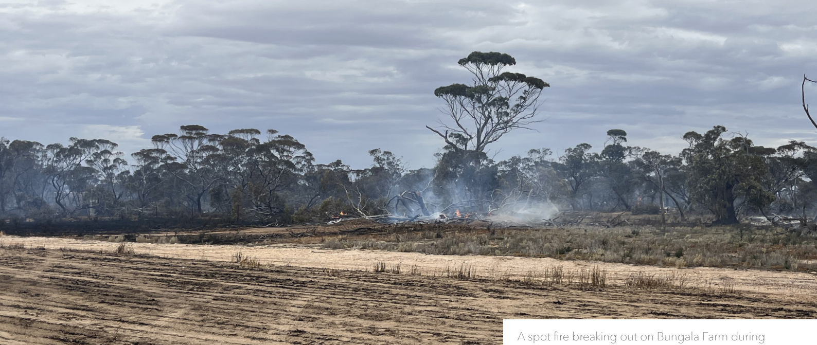
A spot fire breaking out on Bungala Farm during peak harvest conditions.